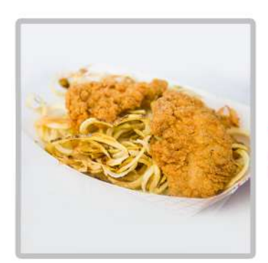
CHICKEN BASKET WITH CURLY FRIES

Topped with our signature sauce & Parmesan cheese.