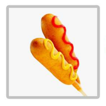
FOOT LONG CORN DOGS